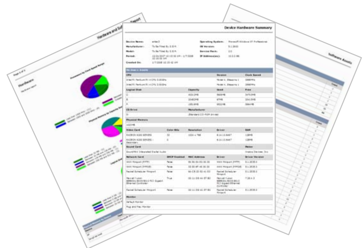
Site Hardware Summary Device Attributes Software Asset Inventory