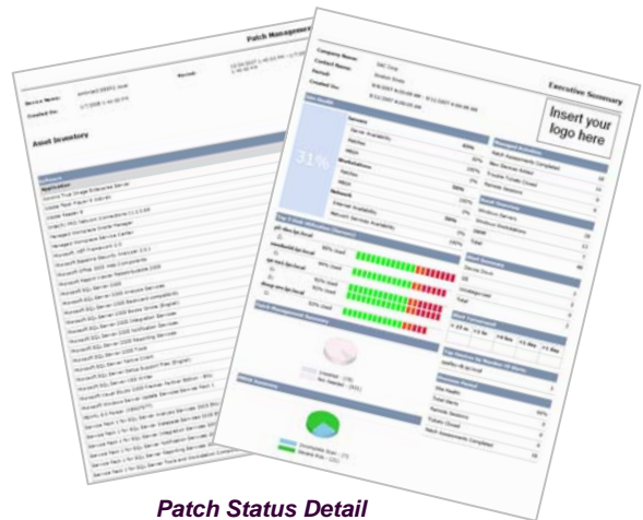
Patch Status Detail Server Health Report