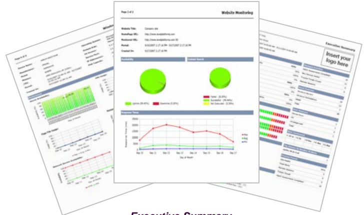
Web-based Central Dashboard